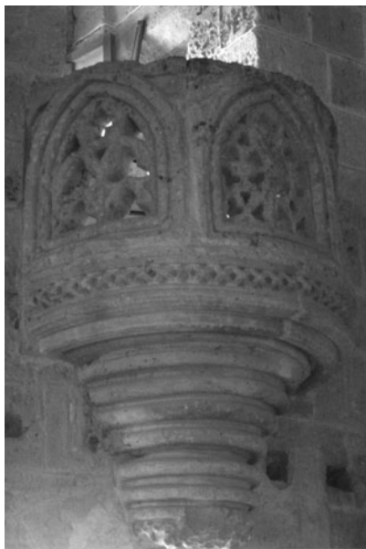
5. Refectory pulpit. Bellepais Abbey, northern Cyprus

The best place to observe correct conduct in the refectory is in the constitutional decrees passed by the Cistercians, which were designed to ensure that Benedict's Rule was followed to the letter. In the earliest set of decrees, passed in 1134, no speaking was allowed in the refectory. Instead monks were supposed to use sign language to make their needs known. Only if a monk was not fluent in sign language and could not make himself understood was he allowed to utter a single word, such as 'bread' or 'water'. The